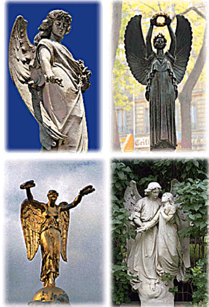
The four angels I carry to Israel